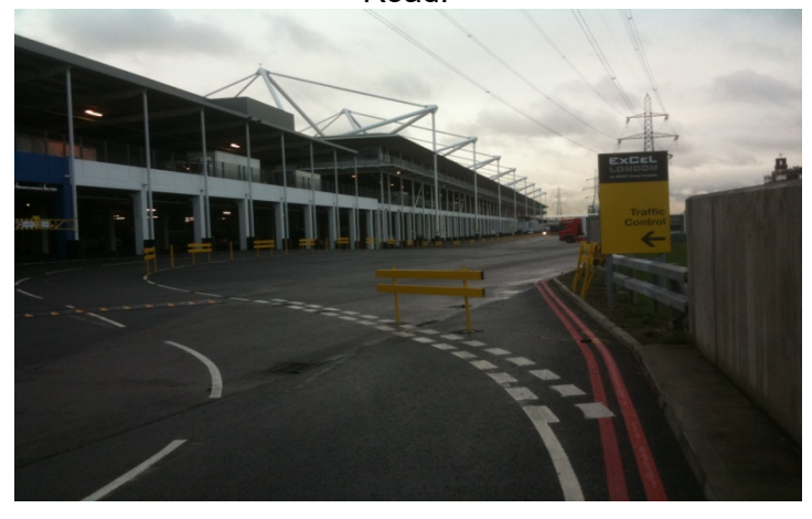
Please enter the Traffic Marshalling Yard left of the yellow sign shown above.