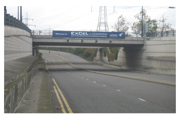
All Build & Break vehicles must gain access to the site via the East Entrance, On Sandstone Lane. The post Code is F16 1DR. When approaching the east end of the site you will pass under the

Code is E16 1DR. When approaching the east end of the site you will pass under the Bridge pictured above.