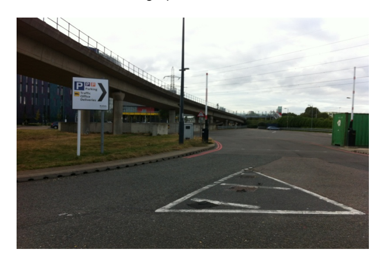
Please take the last right turn on the roundabout and enter the site via the Service Road.

Code is E16 1DR. When approaching the east end of the site you will pass under the Bridge pictured above.