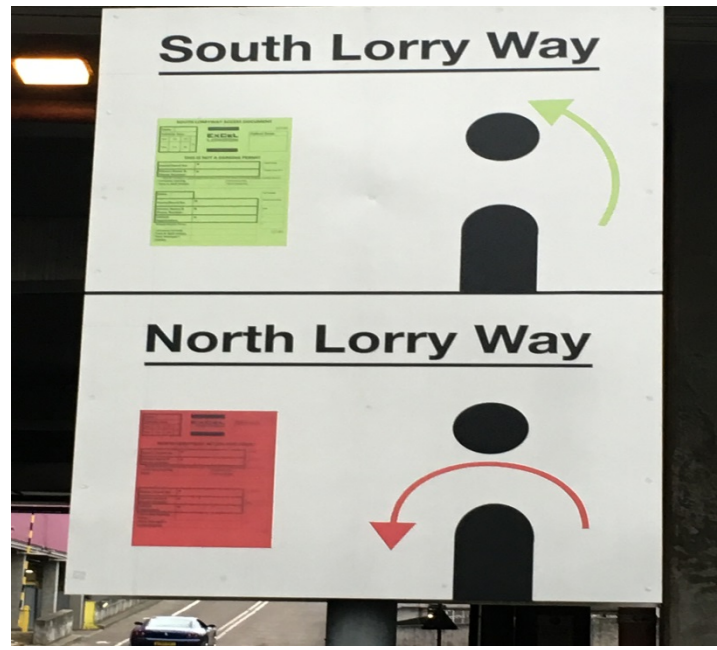
Please follow the signs for the North & South Lorry Ways