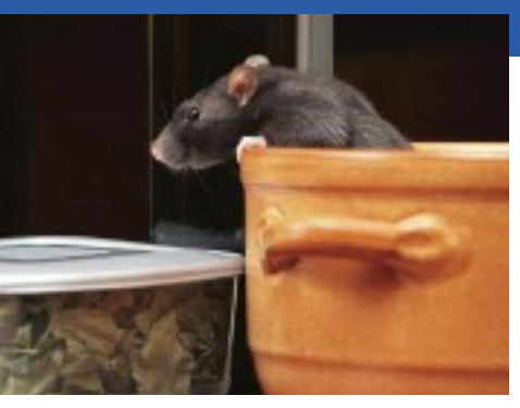
Wednesday 19th May 2010 28 Portland Place, London W1B 1DE