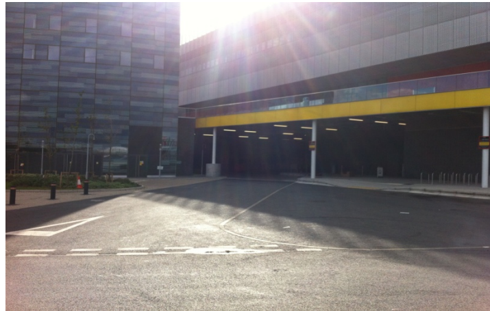
Capital Hall and Capital Suites delivery area, two ways traffic in this area.

Vehicles requiring the Capital suite or Capital halls (East traffic) will be sent back along the service road to the various areas at the East end of the building, Entrance below is sign posted for deliveries.