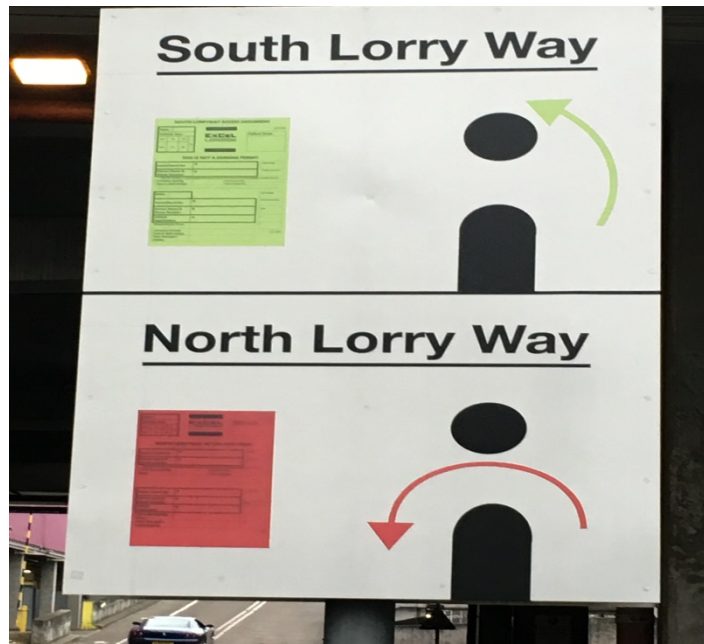
Please follow the signs for the North & South Lorry Ways