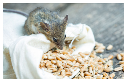
Mice can spread many nasty diseases to humans, normally through urine or body coming into contact with food preparation areas.

These nibbling nuisances can also cause a lot of property damage, due to their compulsive need to gnaw to maintain their teeth at a constant length.