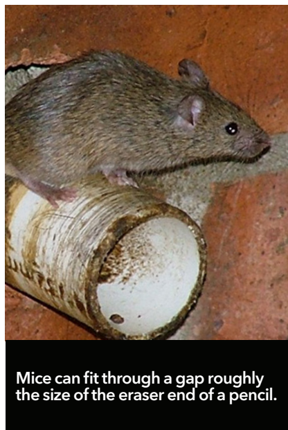
Mice can fit through a gap roughly the size of the eraser end of a pencil.

You will need to search for any potential entry points and seal these up with wire wool embedded in quick-setting cement.