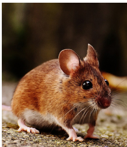
Field mouse ( Apodemus sylvaticus ). One of the most common types of mouse in the UK.

Whether you're thinking about doing some DIY pest control or you're looking to enlist the help of a professional pest management company, this guide is for you.