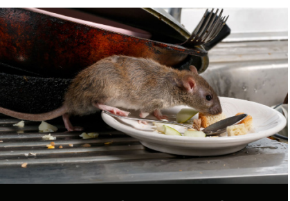
Rats can spread many nasty diseases to humans, normally through rats' urine or body coming into contact with food preparation areas.

rats are not just limited to public health. They also have a knack for causing structural damage.