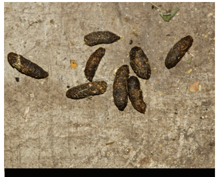
Rat droppings are dark and pellet-shaped.

marks on electrical cables, woodwork, plastic, brick and